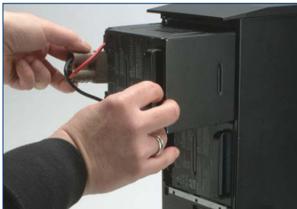
User-friendly, hot-swappable battery replacement

Hot-Swappable, User Replaceable Batteries allow continuous operation of the load when batteries are being replaced by the end user.