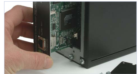
APC accessory cards can be inserted into the built-in SmartSlot to allow monitoring of power conditions. The SURT XL 5000, 7500, and 10,000 units ship bundled with the Web/SNMP Management Card

Built-in SmartSlot houses APC's accessory cards, which increase overall system manageability through timely notification of hazardous conditions.